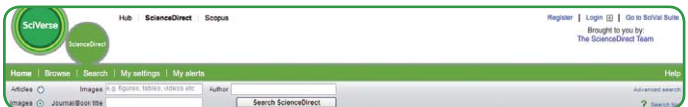
Image search using Quick Search bar

Enhanced with functionality specifically designed to support image searching, SciVerse ScienceDirect continues to evolve to support the needs of students, teachers and researchers.